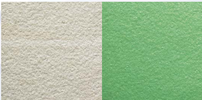
Under Normal Light