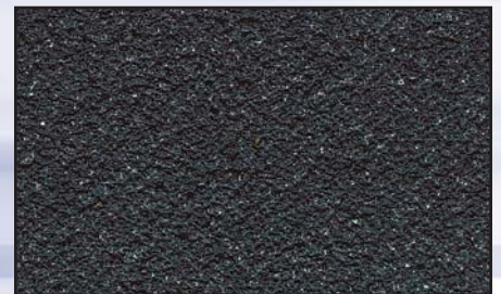
Ultra Grip Black

IMPORTANT NOTICE TO PURCHASER: THE FOLLOWING IS MADE IN LIEU OF ALL WARRANTIES, EXPRESSED OR IMPLIED, INCLUDING WARRANTIES OF MERCHANTABILITY AND FITNESS FOR A PARTICULAR PURPOSE: Purchase or use of this product constitutes an agreement with Seller and Manufacturer that, if the product proves to be defective or in any way unsuitable, Seller's and Manufacturer's limit of liability for all damages, including but not limited to incidental or consequential damages, and User's or Purchaser's exclusive remedy, regardless of legal theory, including theories of breach of warranty, negligence and strict liability, shall be to receive, at Seller's or Manufacturer's option, repair of the defective product, and equivalent quantity of replacement product or a refund of the purchase price.